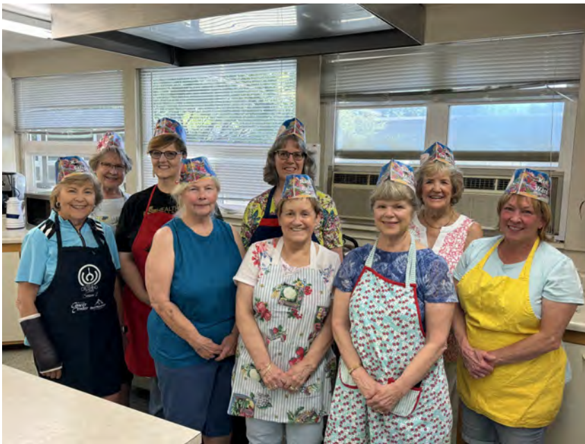
Some of our amazing kitchen team members!

We had 33 kids participate, 33 helpers, crew/station leaders, behind scenes helpers, 17 kitchen crew members and served 300 meals!