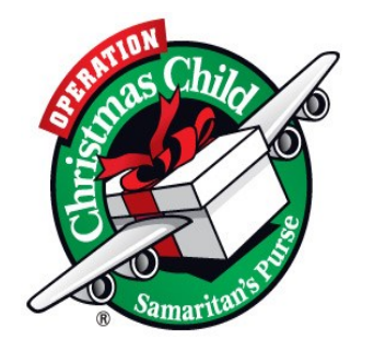
165 boxes sent in 2022!

This is also a great time to start writing notes to be included in the boxes! A simple handwritten note, even on just plain stationary or notebook paper, letting the recipient know that Jesus loves them, will go a long way in making the box more personal.