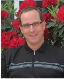
From Pastor Steve

1 To humans belong the plans of the heart, but from the Lord comes the proper answer of the tongue. 2 All a person's ways seem pure to them, but motives are weighed by the Lord. 3 Commit to the Lord whatever you do, and he will establish your plans. 4 The Lord works out everything to its proper end— even the wicked for a day of disaster. 5 The Lord detests all the proud of heart. Be sure of this: They will not go unpunished. 6 Through love and faithfulness sin is atoned for; through the fear of the Lord evil is avoided. 7 When the Lord takes pleasure in anyone's way, he causes their enemies to make peace with them. 8 Better a little with righteousness than much gain with injustice. 9 In their hearts humans plan their course, but the Lord establishes their steps.